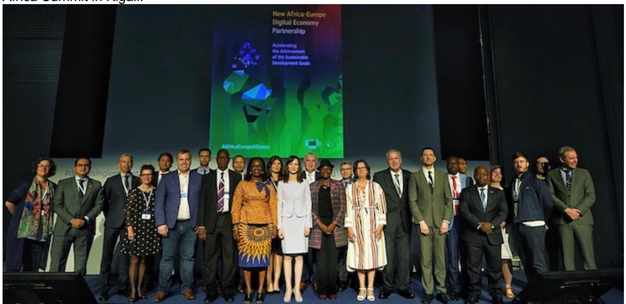
The Digital Economy Task Force and Sherpa's at the launch of the final report at the Digital Assembly in Bucharest, including H.R.H. Princess Abze Djigma, European Commissioners Mariya Gabriel and Neven Mimica, Minister of Communications of Ghana, Ursula Owusu-Ekufuland and Sherpa Anton Martens

The report has been adopted by European Commissioners Mariya Gabriel and Neven Mimica, and Minister of Communications of Ghana, Ursula Owusu-Ekuful, at the Digital Assembly 2019 in Bucharest. A preliminary version of the report was earlier presented in May at the 2019 Transform Africa Summit in Kigali.