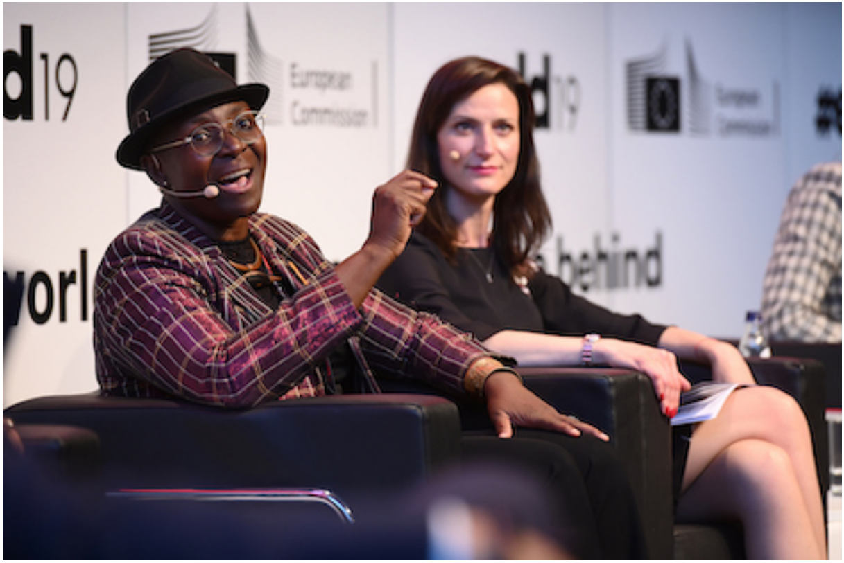
H.R.H. Princess Abze Djigma speaking at EDD2019 with European Commissioner Mariya Gabriel

H.R.H. Princess Abze Djigma participated in 2 panels: